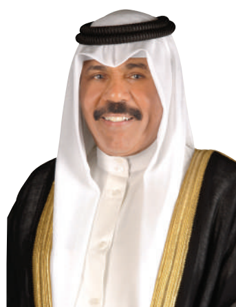
His Highness Sheikh Nawaf Al-Ahmed Al-Jaber Al-Sabah Crown Prince