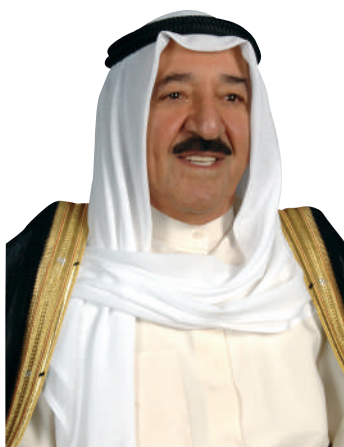
His Highness Sheikh Sabah Al-Ahmed Al-Jaber Al-Sabah Amir of the State of Kuwait